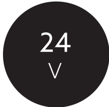
Output voltage range