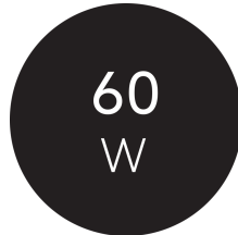
Output power range