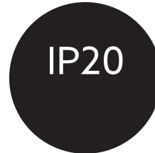
Degree of protection (IP)