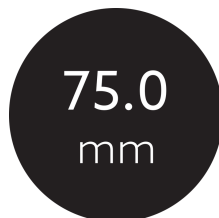
Length of particular segments