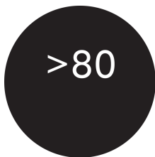
Colour rendering index CRI